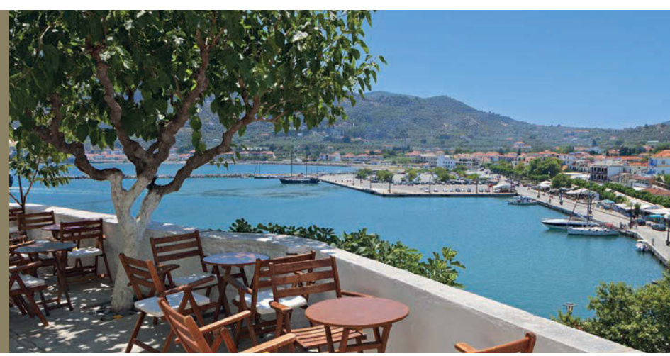
View over Skopelos Town

Reached by flying cat/ferry from Skiathos, SKOPELOS DRAGON CLIFFS